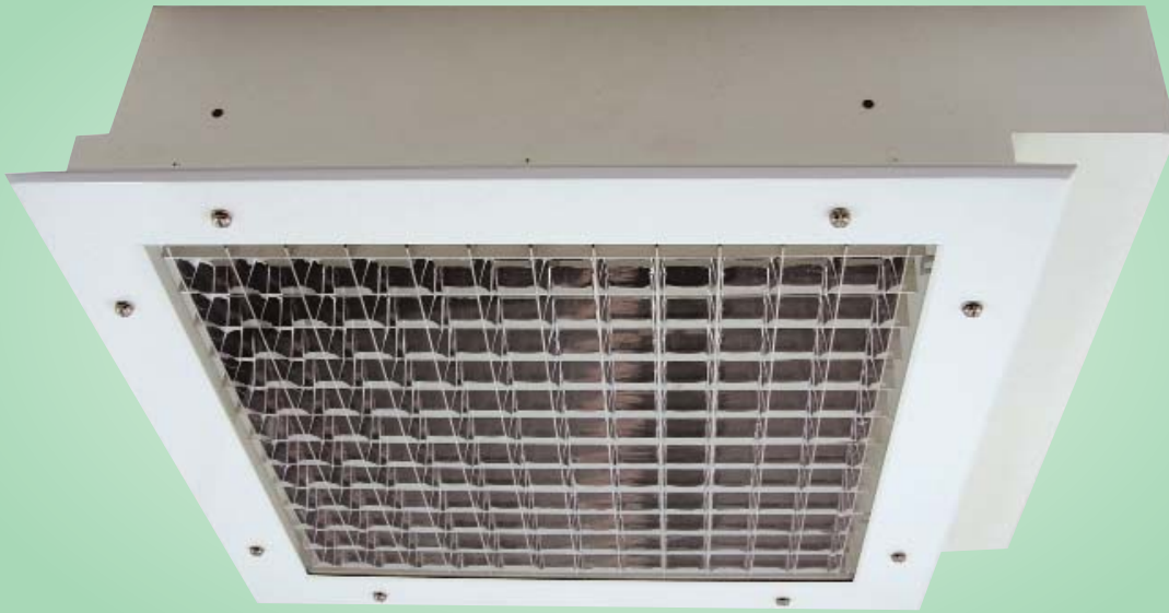
Picture features paracube low glare diffuser